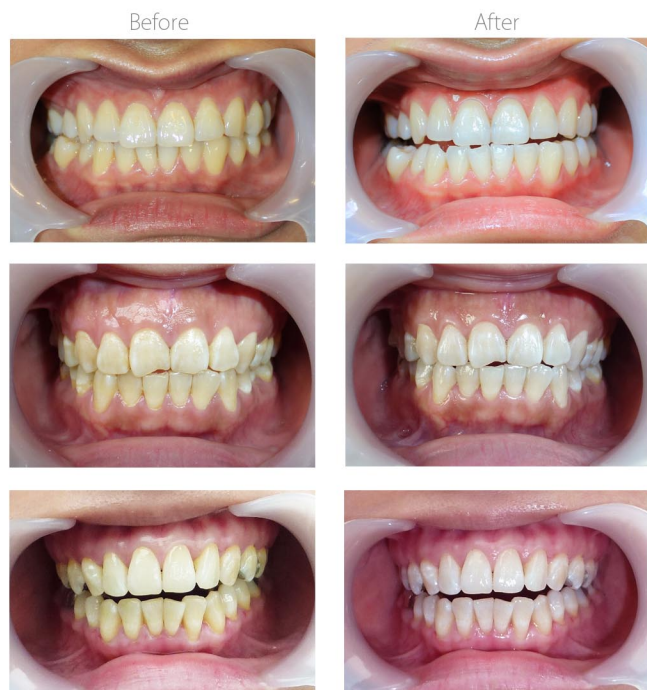
Above photos are taken before and after the whitening procedure using InnoWhite Pro HP35

InnoWhite Professional Dental Whitening System create Enchanting Smiles worldwide