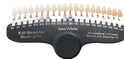
InnoWhite R-20 Shade Guide

There are relatively few side effects from tooth whitening. A very small percentage of consumers may experience some sensitivity during the whitening procedure. This discomfort which typically goes away within 24 to 48 hours, can be minimized with the desensitizing agent supplied together with the InnoWhite dental whitening system. In rare cases, some consumers may also experience gingival irritation. This too is temporary and will go away once the whitening is stopped.